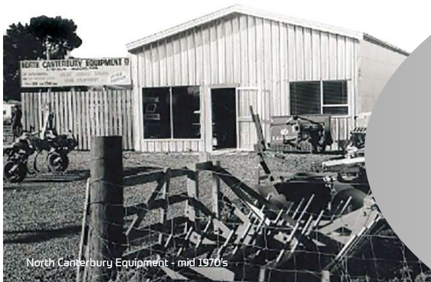
North Canterbury Equipment - mid 1970's

We are located on more than half a hectare on State Highway One in Amberley, with a 1600sqm building which consists of; offices, showroom and the service workshops. The core of our business is buying and selling of all farm machinery, both new and used sourced from both New Zealand Manufacturers and Overseas.